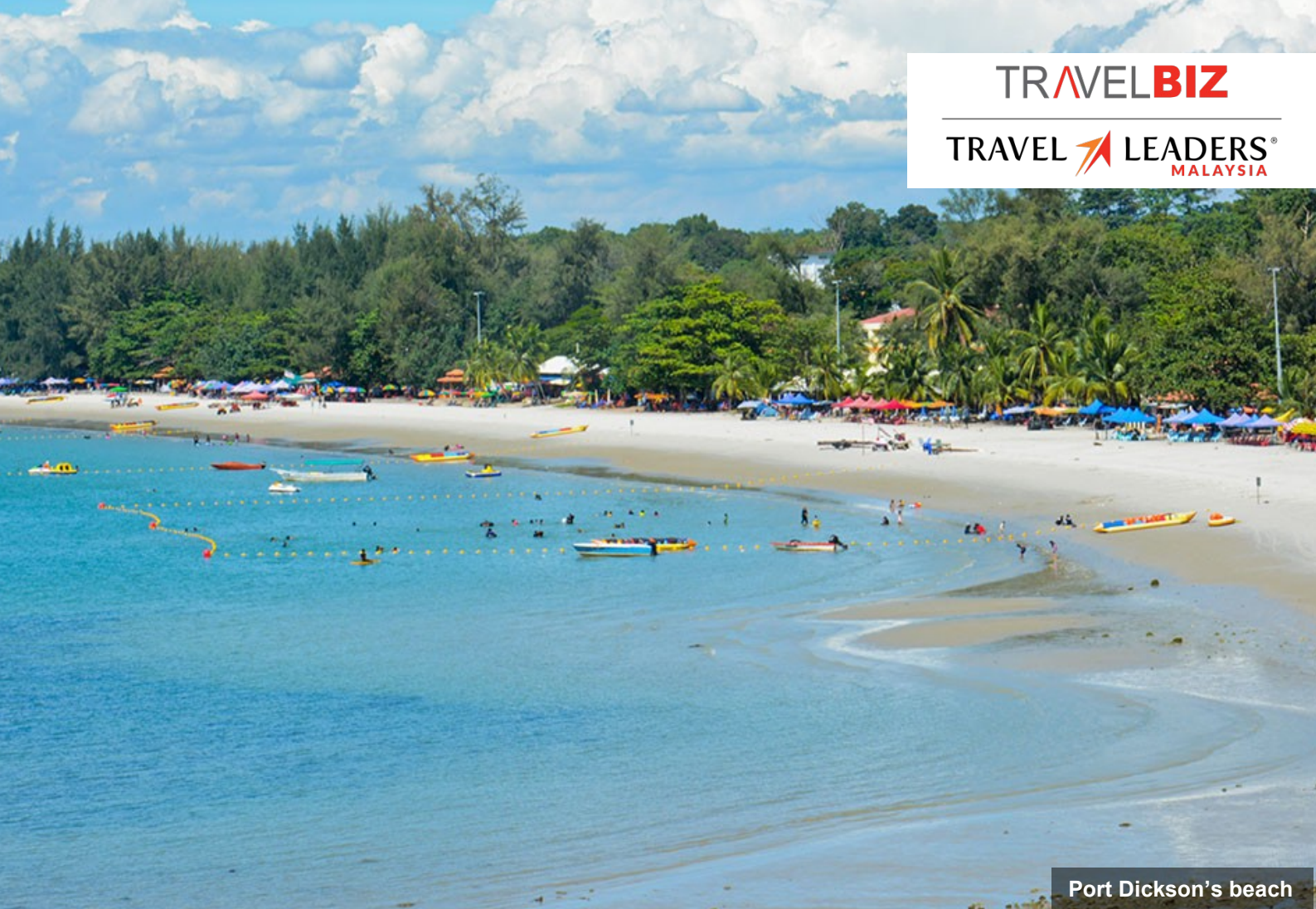
Port Dickson's beach